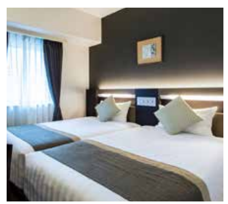
OSAKA UMEDA Hotel new Hankyu Osaka Annex 302 guest rooms