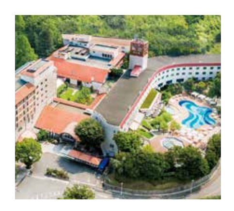
OSAKA TOYONAKA Senri Hankyu Hotel Osaka 203 guest rooms