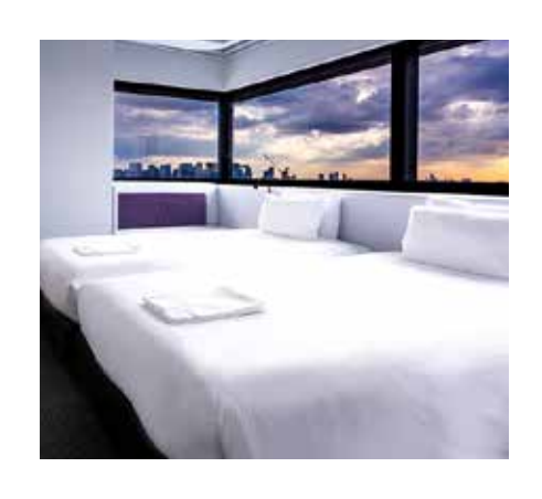
remm Shin-Osaka 296 guest rooms