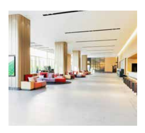
OSAKA UMEDA Hotel Hankyu RESPIRE OSAKA 1030 guest rooms