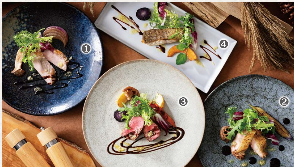
① Pork loin

*The ingredients are subject to change due to supply reasons. Please ask the floor staff about the ingredients.