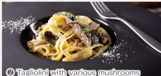
② Tagliolini with various mushrooms