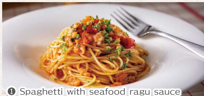
① Spaghetti with seafood ragu sauce