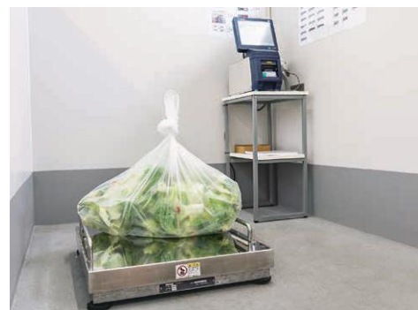
Food loss measurement system in place: Hotel Hankyu International, Takarazuka Hotel, Dai-ichi Hotel Tokyo, Hotel Hankyu Respire Osaka, Hotel Hanshin Osaka