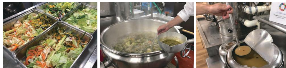
Vegetable broth-based miso soup and other kinds of soup are served.

Vegetable scraps generated during the cooking process are usually disposed of. We offer vegetable broth soup prepared by effectively using these scraps at our directly-managed staff cafeterias in our hotels. Using the nutritional components of vegetables to the fullest extent, this initiative promotes our employees' health and further encourages waste reduction. Through this initiative, we also afford our employees the opportunity to be reminded of our efforts to achieve SDGs on a daily basis, thereby striving to raise their awareness of SDGs.